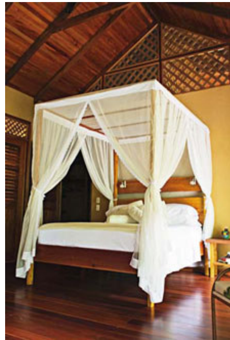
Casa del Bosque master bedroom.

Geckoes Lodge's slogan is “barefoot luxury,” evoking a place where guests can experience comfort in an unspoiled atmosphere. The grounds are by no means perfectly manicured, but the beautiful disarray of natural plants, trees and wildlife makes the setting enchanting.