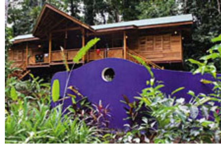
Casa Bromelia exterior.

Though just four kilometers from the town of Puerto Viejo, Geckoes Lodge seems farther.